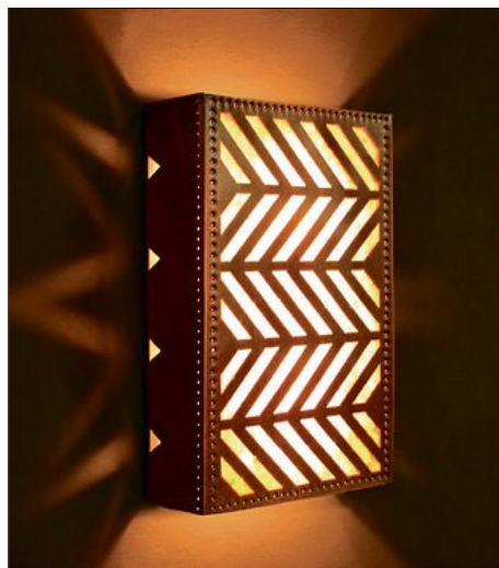
An elegant housing for otherwise simple lighting accents will always get noticed.

“That whole ‘Texas Tuscan’ movement that’s been going on for so long, I think a lot of people like to pull the